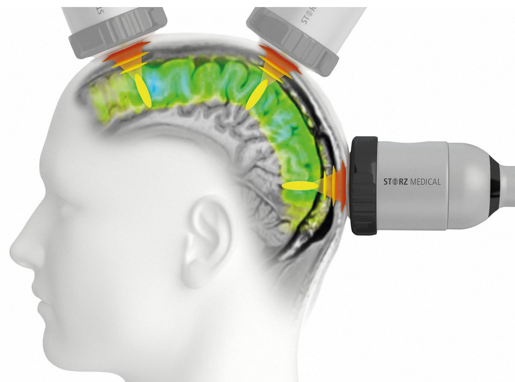
Fig.1 Stimulation-pulses are administered by MRT-tracking on the surface as well as in deeper structures of the brain.

TPS (Transcranial Pulse Stimulation), which can be individually tracked by MRT-scans, offers new perspectives to ameliorate deficits caused by AD. Pilot studies show beneficial effects on learning and memory of TPS. There are also reports of restorative structural changes in the thickness of the cerebral cortex due to the stimulation.